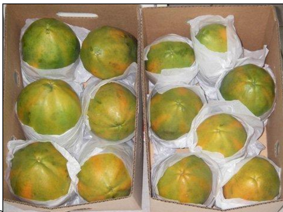
Pawpaw ready for harvesting

The bottom of the crate should be filled with shredded paper to cushion the fruits. Before packing, the peduncle should be cut to about 5 mm and the fruits packed in one layer with the peduncle facing the bottom so that the papain drains and gets absorbed by the shredded paper. The field crates containing the fruits should be left in shaded conditions protected from the sun and rain. You should never use mesh bags, sacks or baskets for pawpaw transport due to the high susceptibility to bruising the fruit.