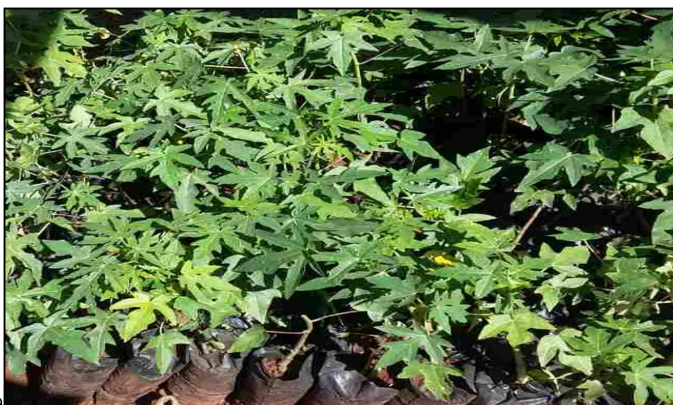
Pawpaw seedlings in a nursery

The best practice is to raise the seedlings in nursery beds that is about 1 metre wide and 10 centimetres high or in pots, polythene bags or a seedling tray. The seeds are first soaked for 24-48 hours in an optimiser (you can get this from an agro-vet shop or ask them of any solution they have for breaking seed dormancy).