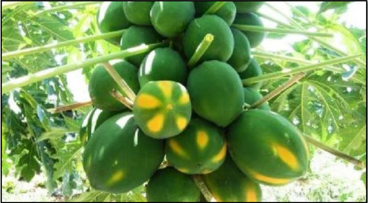
Pawpaw ready for harvesting