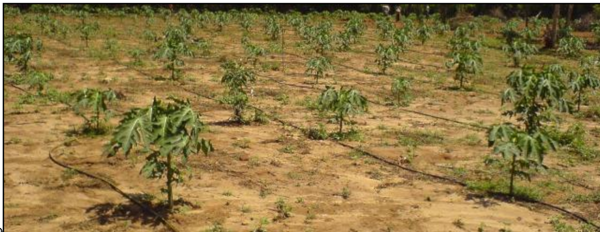
Young transplanted Pawpaw seedlings

Transplanting should be done when the seedling attain a height of 10 to 15 cm. Pawpaws grow very fast and should attain a height of about 30 cm within the first month of transplanting.