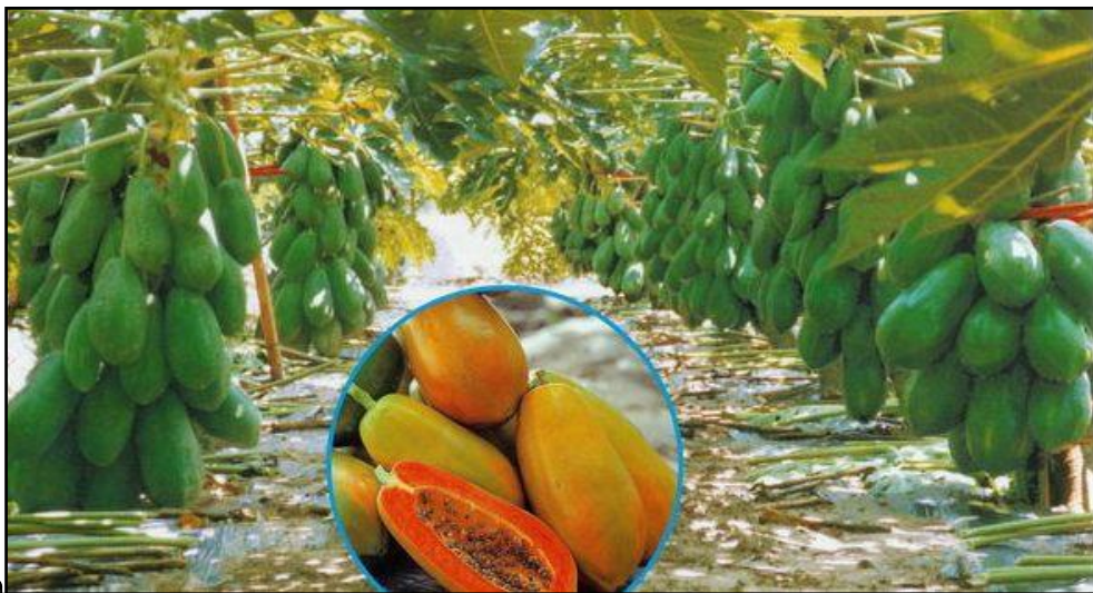
The Hybrid Red-Lady variety Pawpaw

I should have mentioned by now that it is a self pollinating variety just like the other two we have discussed above. That means as a farmer, you do not have the burden of keeping male trees that do not produce fruits in your orchard.