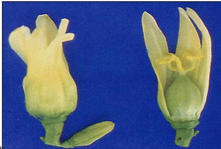
Female pawpaw flower

Female flowers are borne along the trunk and can be identified by that location and the presence of a miniature pawpaw fruit (ovary) inside the base of the flower petals. Male flowers are borne in long sprays that originate along the trunk. Each spray is much-branched with inch-long, trumpet-shaped, male flowers that do not have an ovary. The much desired hermaphroditic flowers are practically identical to the females but contain both an ovary (female organ) and pollen sacs (male organ); they are self-pollinating.