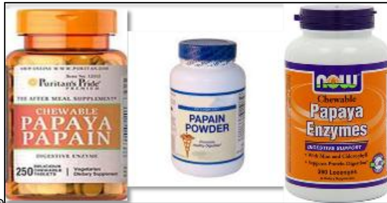
Different papain products in the market

Papain is also used in the manufacture of chewing gum, cosmetics, for degumming natural silk and to give shrink resistance to wool. It is also used in pharmaceutical industries, textile and garment cleaning paper and adhesive manufacture, sewage disposal etc.