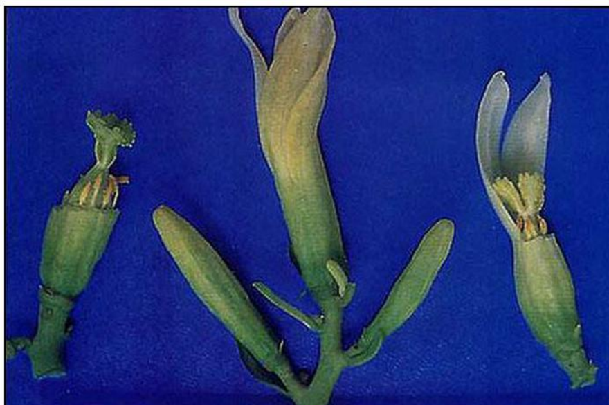
Hermaphrodite pawpaw flower